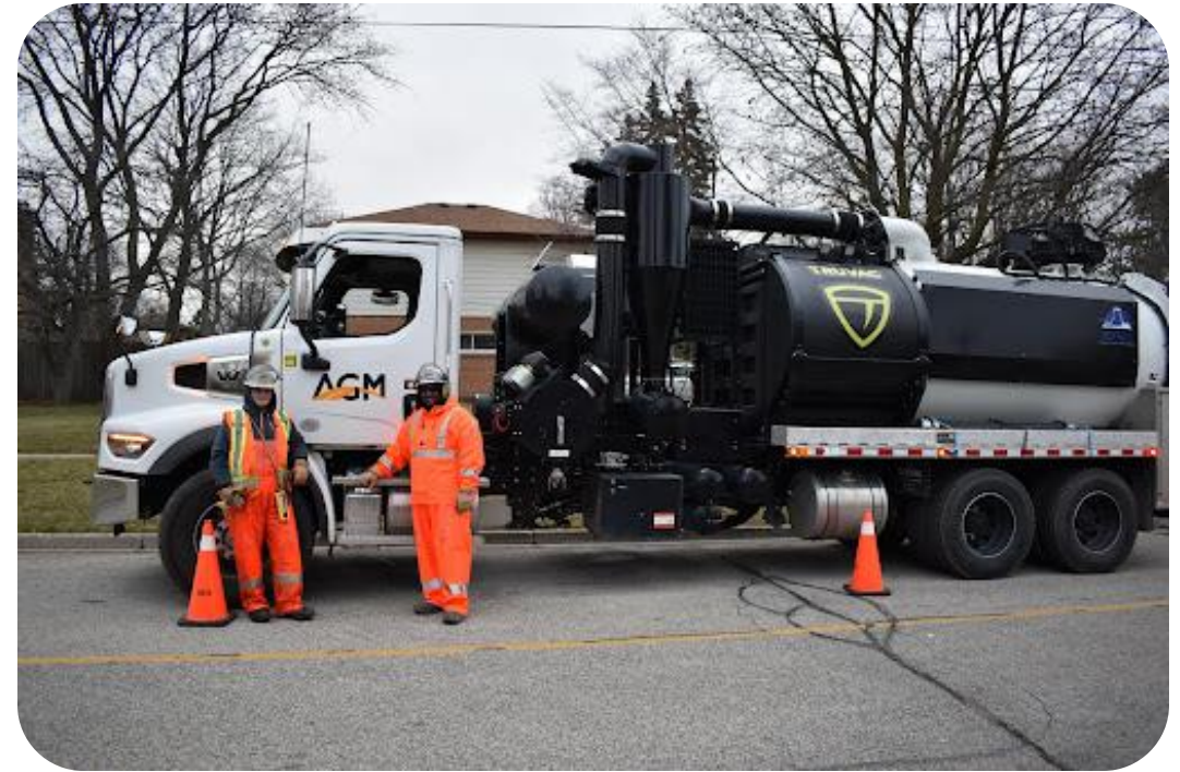
Certified Social Enterprise: A-GM

Buy Social Leader Chandos Construction uses our social enterprise certification to identify social enterprise suppliers for construction projects across Canada, including day labour and catering services.