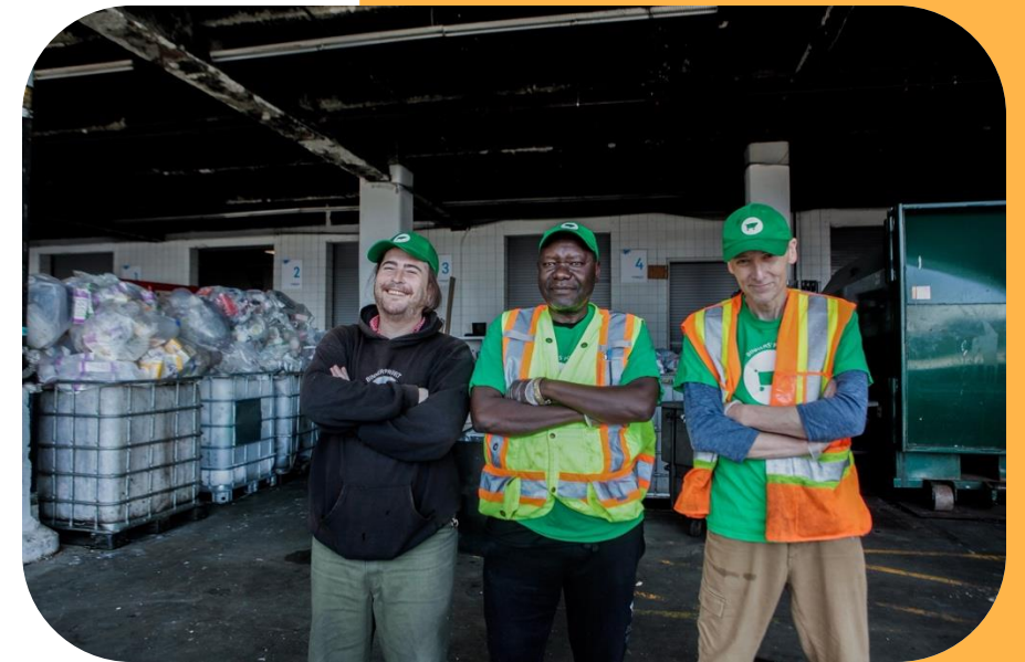
Certified Social Enterprise: Binners' Project