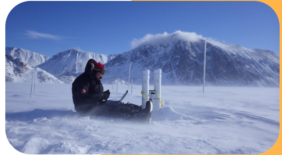
Certified Social Enterprise: SmartICE

If this describes your business, we want to meet you!