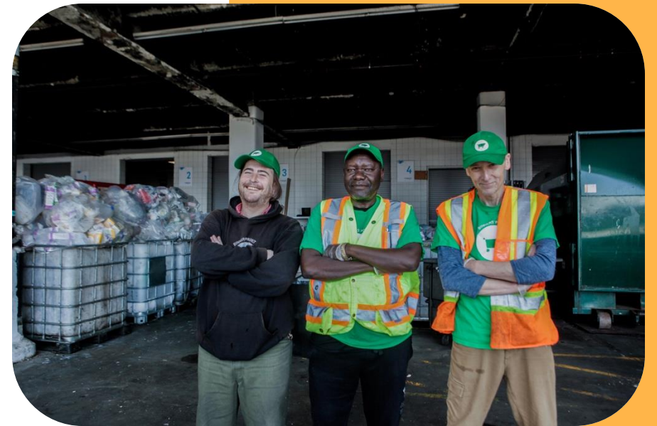
Certified Social Enterprise: Binners' Project