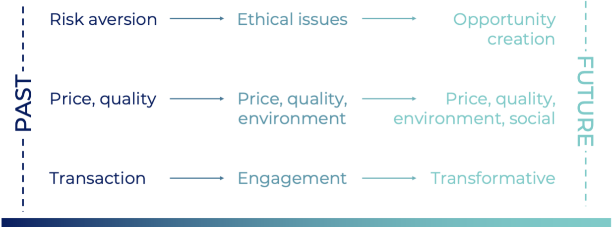
Figure 3. Social procurement: a tool to build healthy communities. Reprinted with permission from Buy Social Canada CCC Ltd. (2021). Social Procurement. PowerPoint presentation (slide 26).